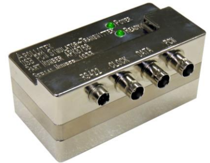
APK8768-B with Battery Pack and programmable attenuator

The Apollotek Model APK8768 Series of Simulators combines the unique features of the Apollotek APK8764 USB powered PCM bit stream Simulator with a wideband low power RF Transmitter, an optional user programmable RF Attenuator and an optional rechargeable battery pack. The APK8768 PCM and SOQPSK-TG Simulator unit is set up and powered through a USB Port connection to a host PC and it provides a high dynamic performance user programmable PCM Simulator with a programmable low power wideband transmitter to provide a portable radio telemetry link and groundstation instrumentation test capability.